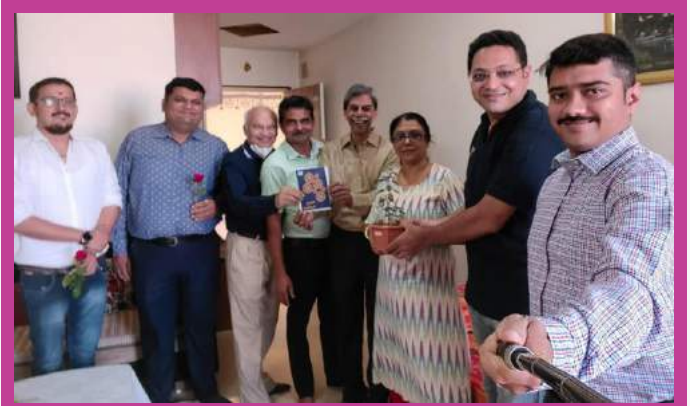
BIRTHDAY OF PP MAHENDRA BULSARA (23rd Nov.)